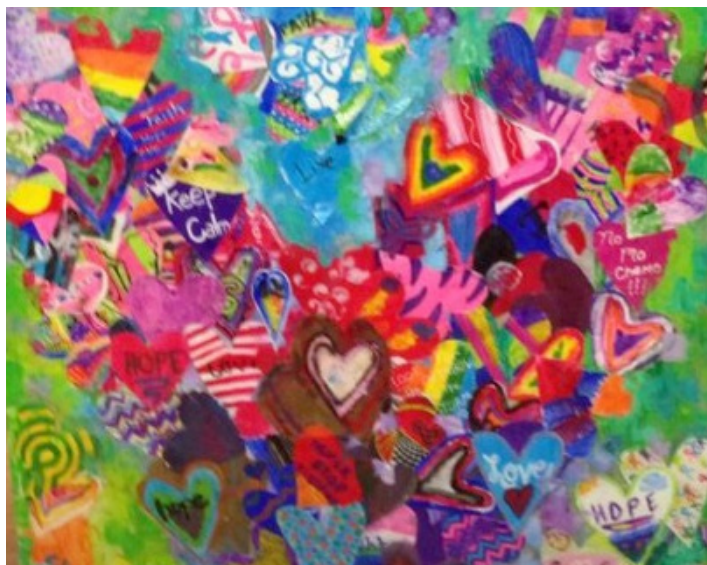
Art created at Texas Oncology–Wichita Falls was auctioned to raise funds for cancer research.